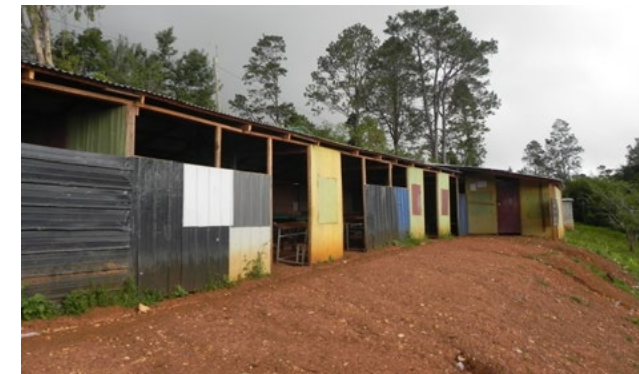
St. Augustin Street School (600 children) in Abricots